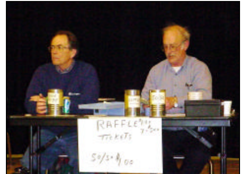
A Couple of raffle tickets salesmen use "High pressure" Tactics on the crowd.