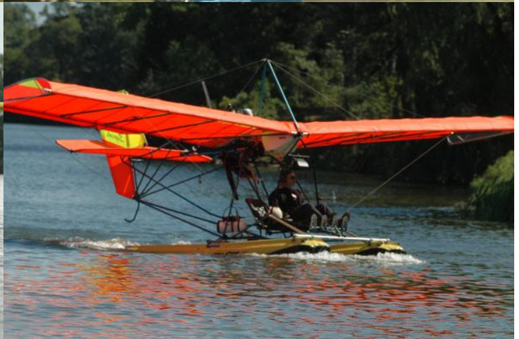
Hey, who snuck in a pair of full size floatplanes!