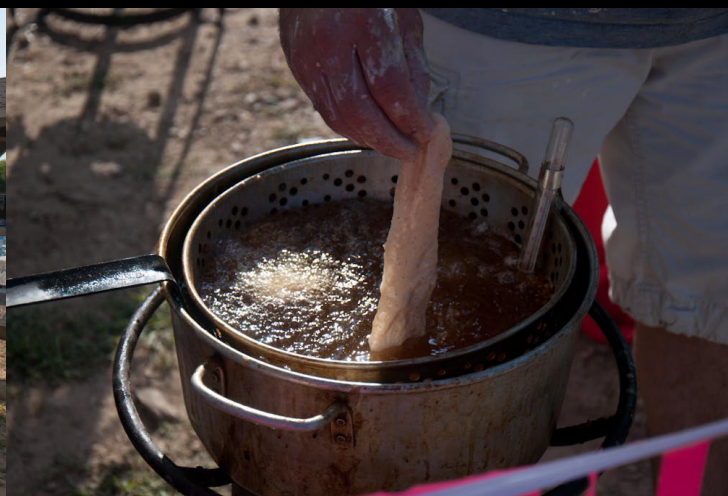
The first piece goes in!