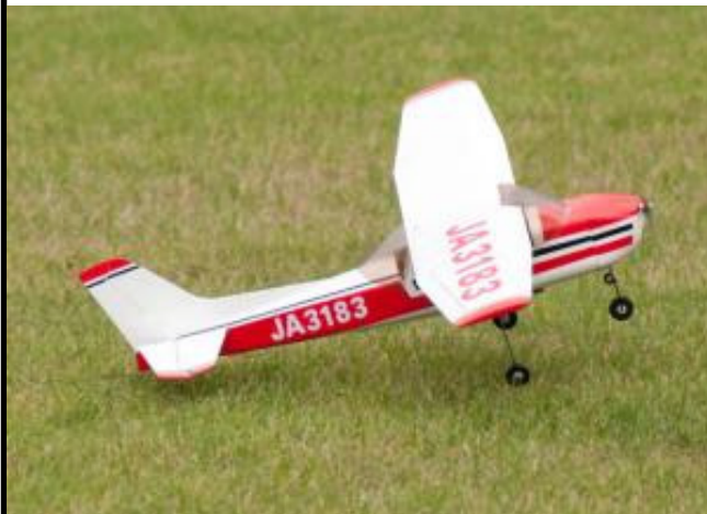
Short field takeoff .