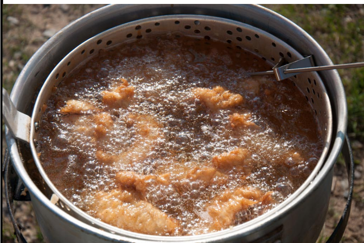
Yum, deep fried cod!