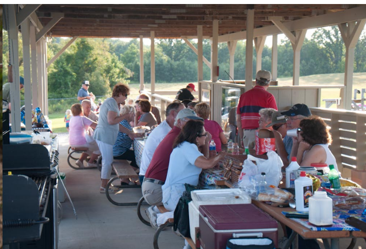
More than 80 members, family and friends joined us this year and tucked away over 50 pounds of fish!