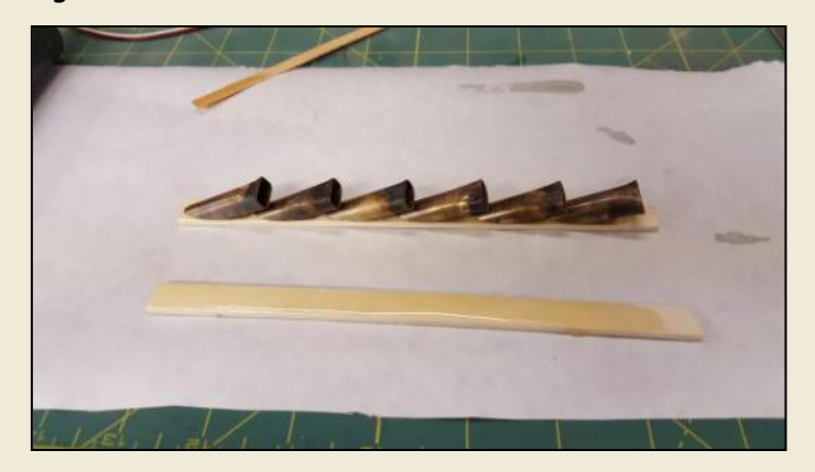
Stacks epoxied to the wood mounting strip

Next I made a strip of lite ply that fits inside of the fuselage recess. Then I applied a thin layer of 15 min. Epoxy to the wood strips and positioned the 6 stacks on the strip. Use the 15 min. Or longer cure epoxy so you have time to make small adjustments to the spacing and alignment.