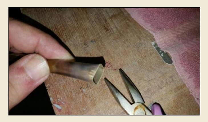
The resulting shape

Next I cut off the end of the tube to the length necessary.