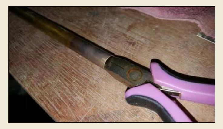
Needle nose and tube ready to reshape

Once softened I press the body of a small needle nose pliers into the softened tube end. You must press pretty hard. I happen to have a needle nose pliers that is a good size for this purpose. If you don't have a good size needle nose you can grind and file a piece of scrap metal to the size and shape needed.