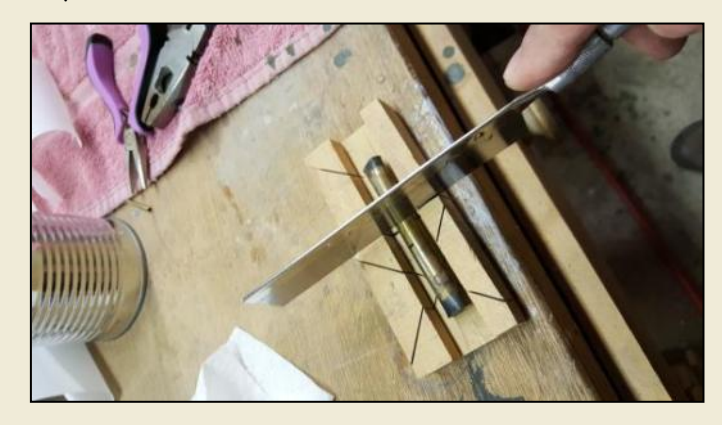
Cut tube to length with razor saw The exhaust stacks on the Stuka are angled back at a

Next I cut off the end of the tube to the length necessary.