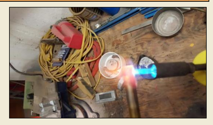
Annealing the brass tubing

I still used brass tubing of the correct scale diameter but I reshaped the round tube at the exit end to a more scale appearing rectangular shape. In the manufacturing process K&S brass tubing gets work hardened and is difficult to reshape. So the first step is to use your propane torch and heat the end of the tube to a red hot condition. After heating, let it air cool. What this does is soften (anneal) the brass so it is more easily reshaped.