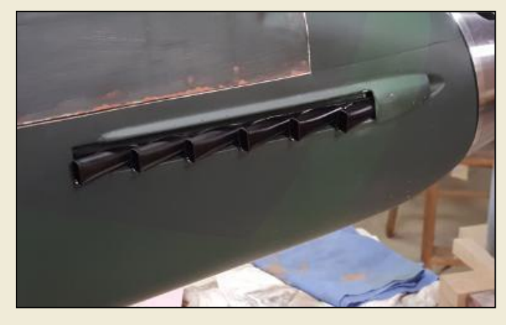
Stacks mounted on fuselage

Next I painted the stacks flat black and mounted them on the fuselage.