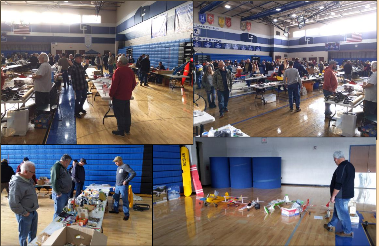
Photos from the Flint Swap